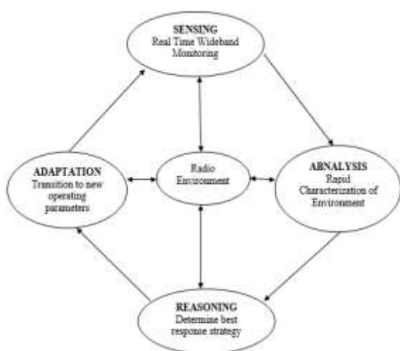
Fig.1 Iterative Channel Sensing

The basic functioning of the cognitive radio framework can be understood using the following figure. In many cases, it can be modified manually to work and operate in a certain way or manner. It may look after the regulatory policies and the presence of the licensed users and the access of the channel and channel state as well. It works in sync to ensure improved radio communication and proper use of the channel bandwidth available. It is also inter-related closely to software defined radio [6].